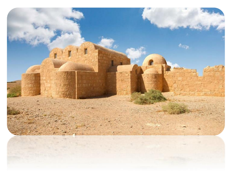
Day 4: Amman – Seven Sleepers Cave – Mt. Nebo – Karak – Petra

After breakfast at the hotel then we head to Kahf Al-Raqeem or The Cave of The Seven Sleepers. Mentioned in the Holy Qur'an in a Sura named Al-Kahf (the Cave), it is located outside the village of Al-Raqeem, 10 km east of Amman. Persecuted by despotic rule of Trajan for monotheism, a group of pious youths took refuge in this cave. To preserve them, Allah put them to sleep, and when they revived 300 years later (309 lunar years as inimitability mentioned in the Holy Qur'an), they thought that they were only asleep for a day or so. Christianity was widespread by then, and when they were discovered, Allah put them to rest forever. At the cave, there still stand Byzantine and Roman ruins as well as a mosque, which exactly fit the descriptions in the Holy Qur'an. Then continue to visit Mount Nebo one of the most revered sites in Jordan. Here you have a magnificent view of the Dead Sea, a panorama of mountains, and the crowning heights of Jerusalem are visible in the distance. On the summit of Mount Nebo, you stand where the Prophet Musa 'Moses' looked over the Jordan River towards Palestine. Mount Nebo also became his final resting place after leading his people from Egypt across the Sinai Desert towards the Promised Land. Allah spoke directly to Moses who then gave his people the divinely revealed laws. It is generally acknowledged that Prophet Moses was buried on Mount Nebo, although there is no actual